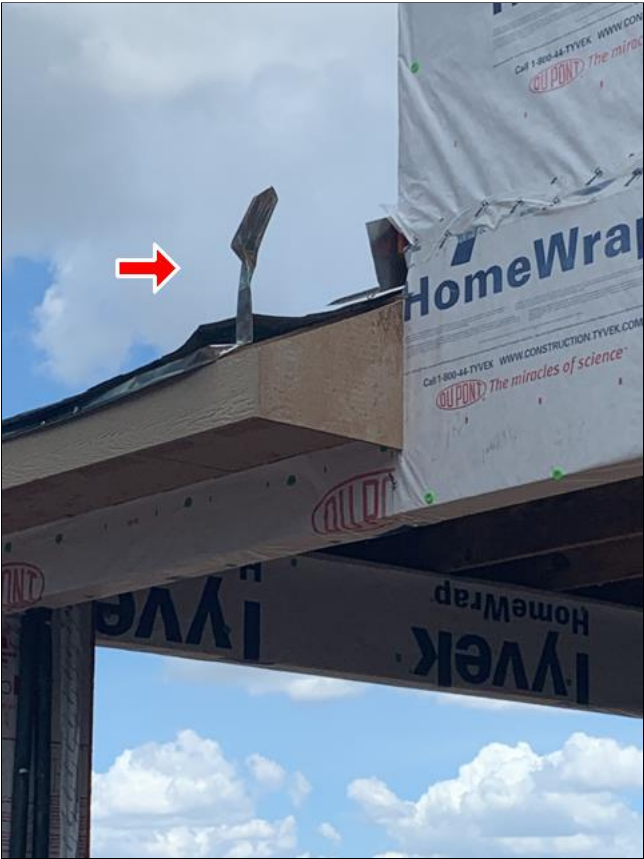
C. Item 1(Picture)

(2) Drip edge flashing is damaged at the rear porch corner