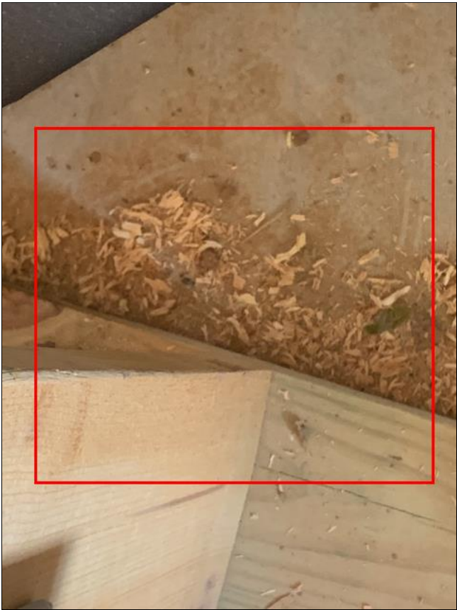
C. Item 2(Picture)