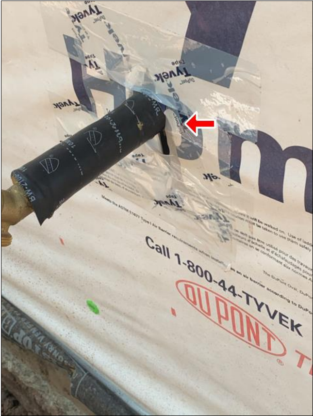
E. Item 8(Picture)