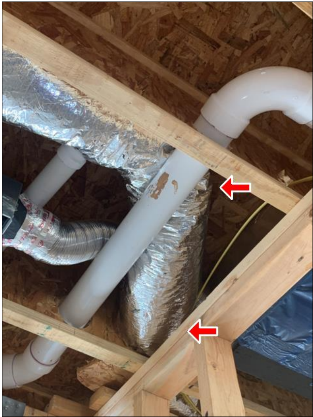
C. Item 4(Picture)