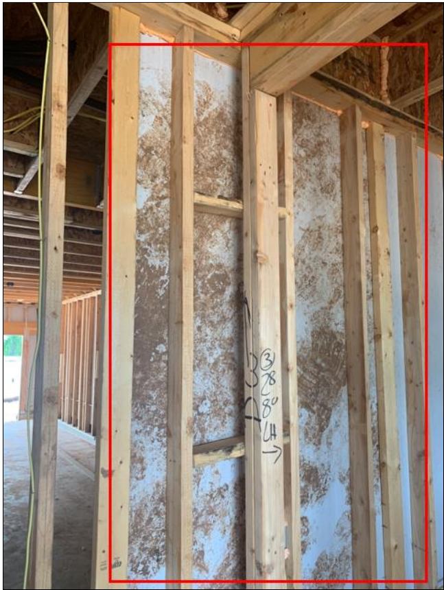
E. Item 3(Picture)

(4) The nail guard is missing over the main gas line at the second floor closet