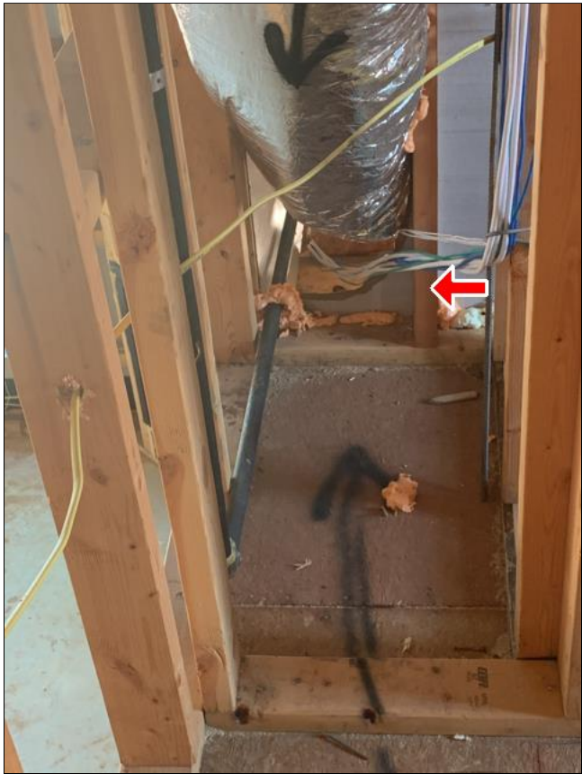
E. Item 6(Picture)

(7) Pex piping is not contained within the column at the corner of the rear porch