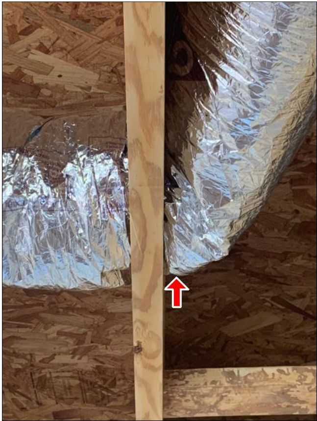
C. Item 1(Picture)

(3) Clean out sawdust and debris from all wall voids prior to sheet rock