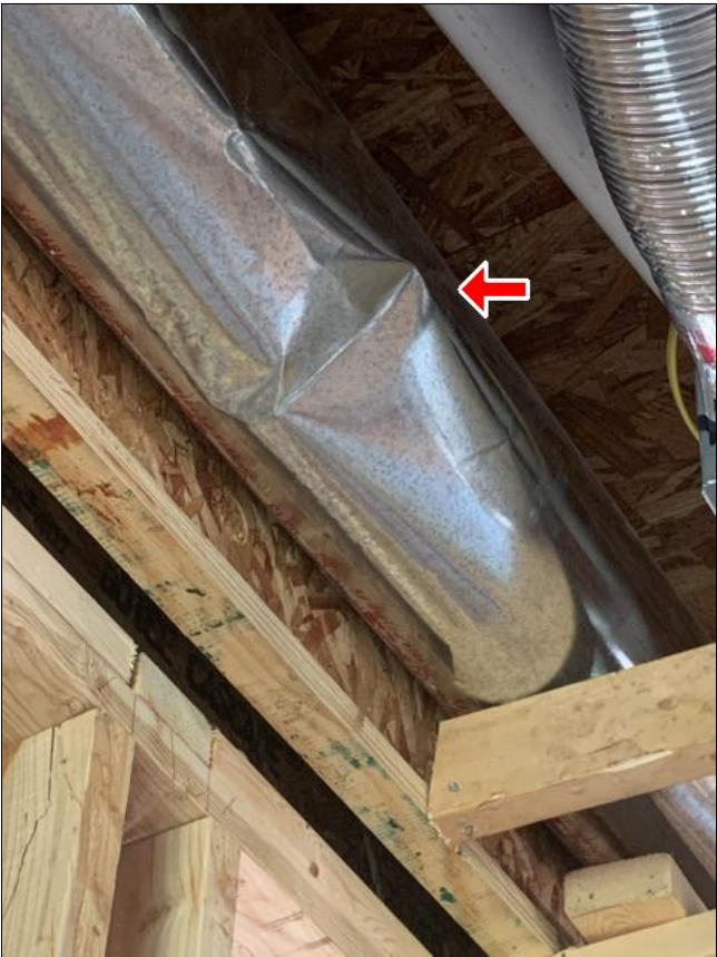
C. Item 1(Picture)