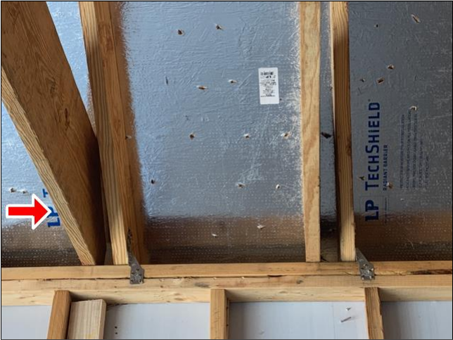
E. Item 1(Picture)