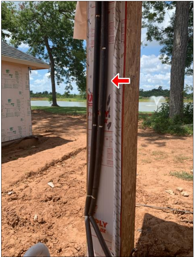
E. Item 7(Picture)

(8) The water line penetration is not properly sealed at the North East exterior wall