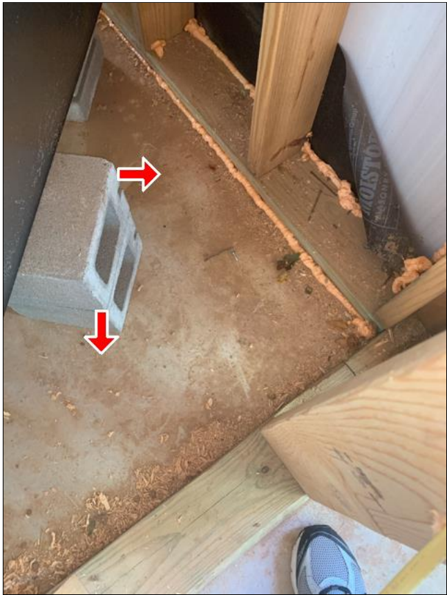
C. Item 3(Picture)

(4) A flex duct is restricted at two locations above the half bath