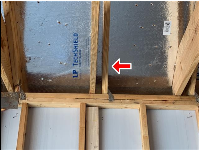
E. Item 2(Picture)