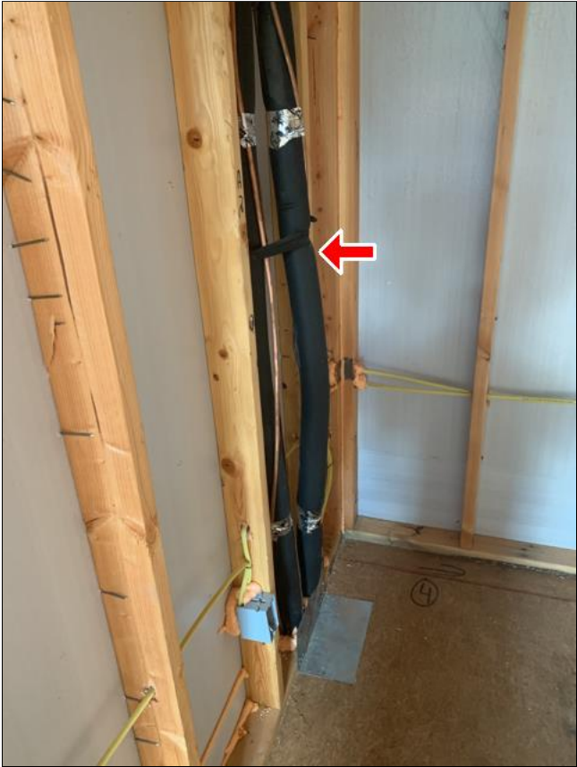
A. Item 1(Picture)