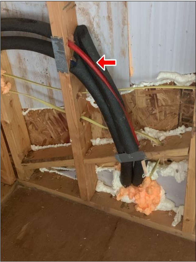
A. Item 1(Picture)

(2) Insulation is not properly installed around the pex piping located at the media room exterior wall