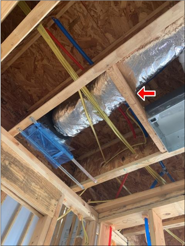
C. Item 5(Picture)

(5) The flex duct to the master bedroom is restricted at the second floor ceiling