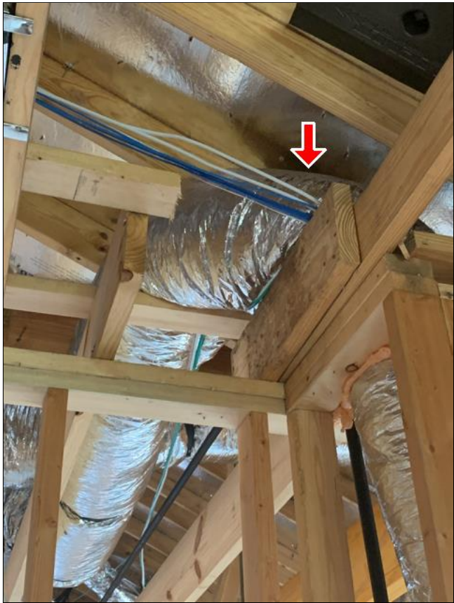
C. Item 6(Picture)