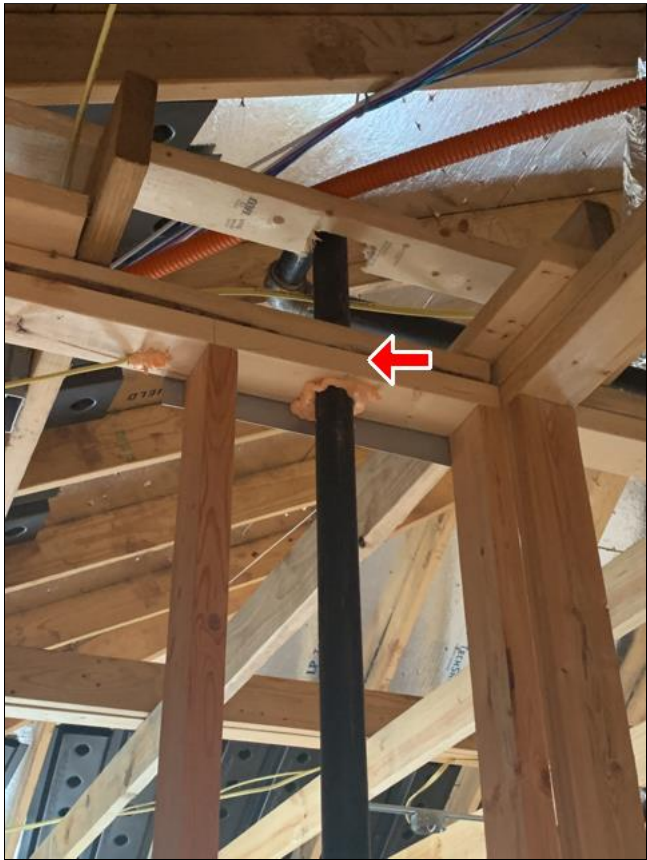
E. Item 4(Picture)

(5) A nail guard is missing over the air conditioning primary drain line above the upstairs bathroom